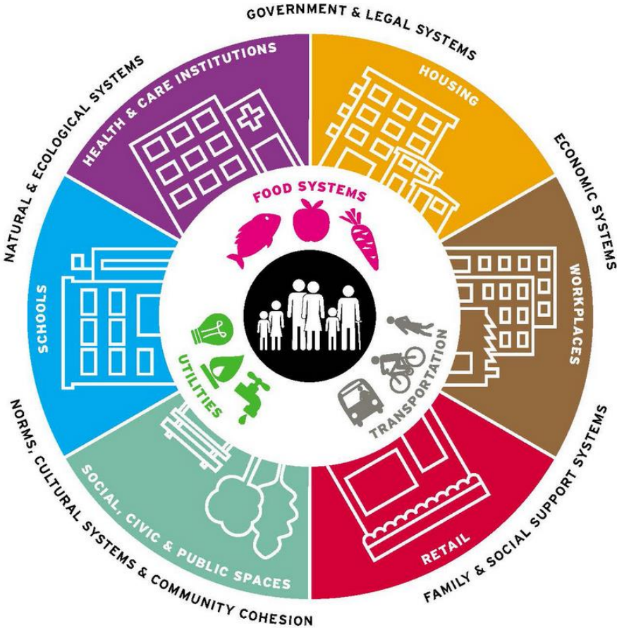
Figure 4 Elements of a healthy community

From the perspective of the integration process, when a person under international protection reaches satisfaction in those main areas of life, he or she will be settled in the community and it becomes their home. This also means that locals start to see them as equal parts of the community. Although the basis for integration needs to be settled from government, and institutions especially non-governmental ones, are making significant efforts to mediate in the integration, the real integration process isn't possible without the effort of those who need to be integrated. And those are both, a person under international protection, as well as locals. In the following text, I will describe daily interactions between locals and a person under international protection through mentioned elements in Croatian local communities.