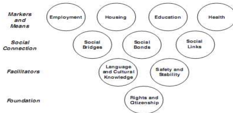
Scheme 2: The Suggested framework indicators for integration assessment, source: Ager & Strang 2004:5