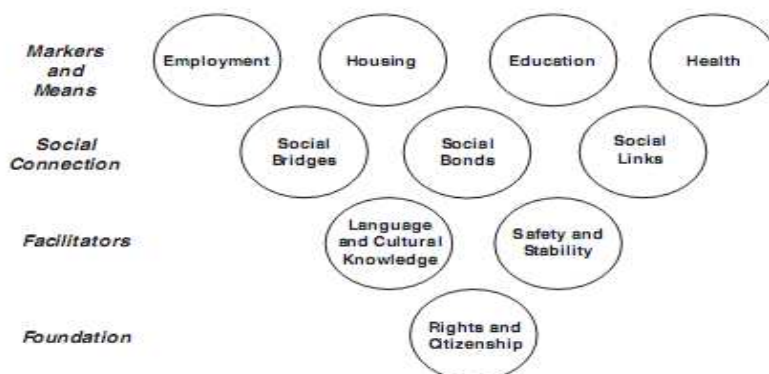
Scheme 2: The Suggested framework indicators for integration assessment, source: Ager & Strang 2004:5