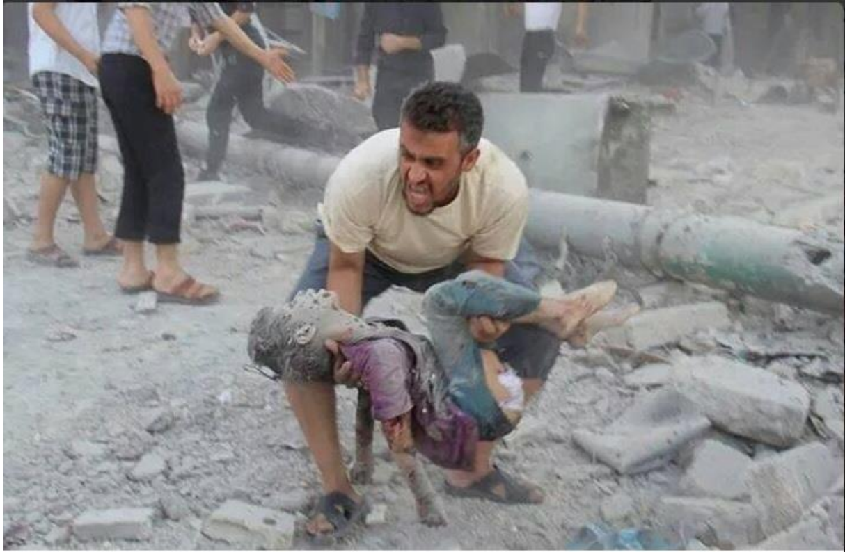
Figure 4 #GazaUnderAttack4