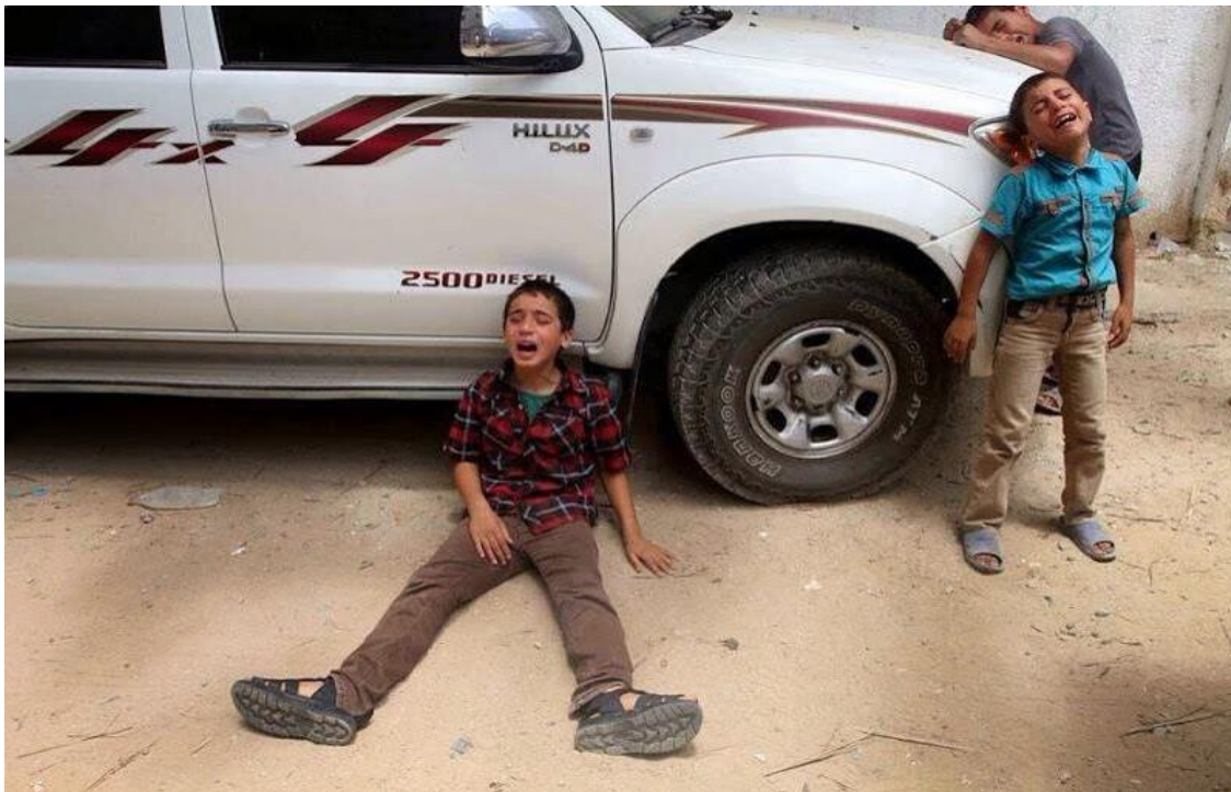
Figure 3 #GazaUnderAttack3