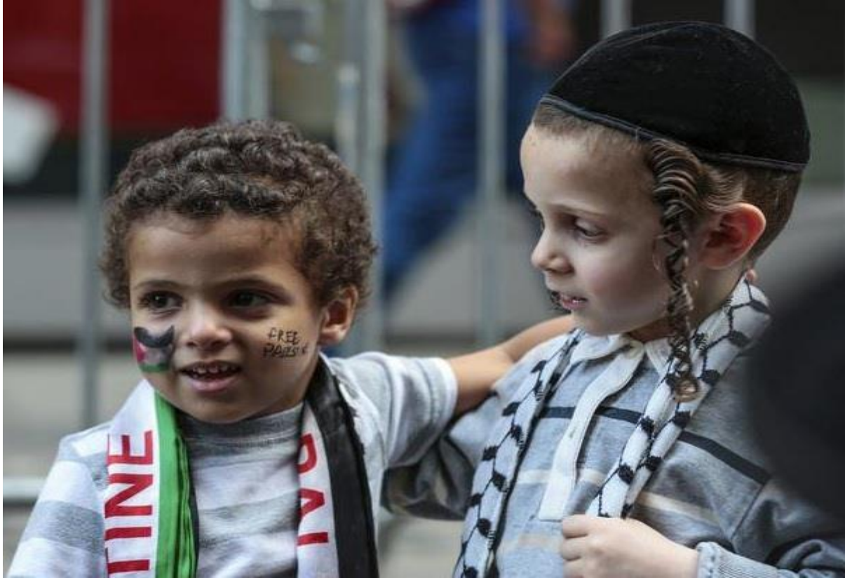
Figure 12 #JewsAndArabs2 Source: Twitter #JewsAndArabsRefuseToBeEnemies image