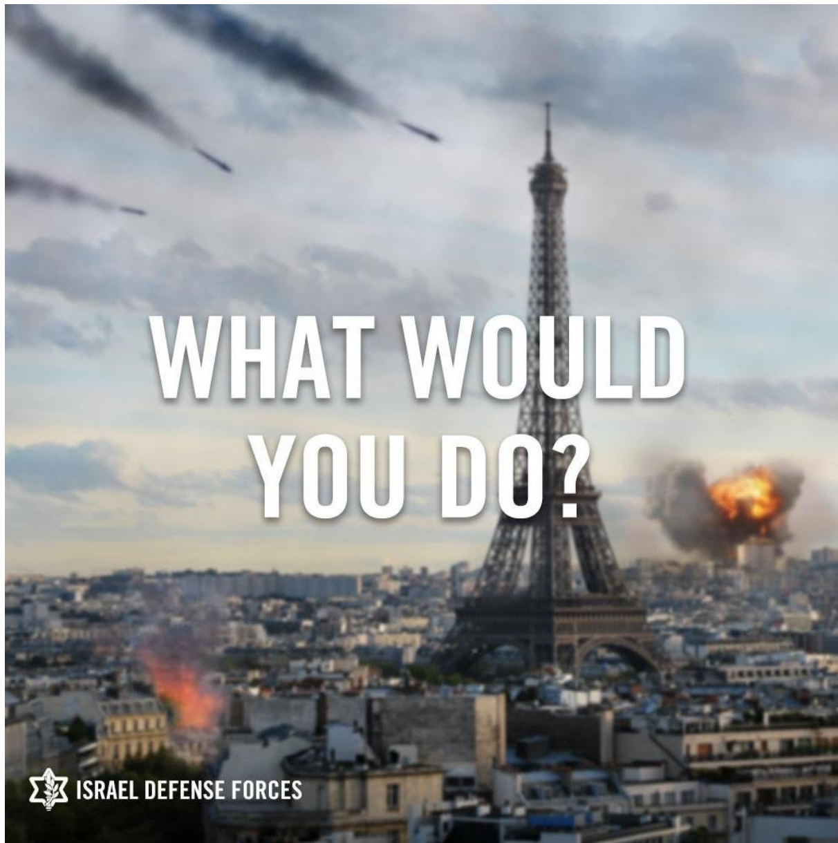
Figure 6 #IsraelUnderFire1