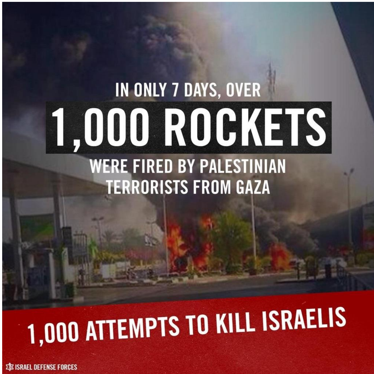
Figure 7#IsraelUnderFire2