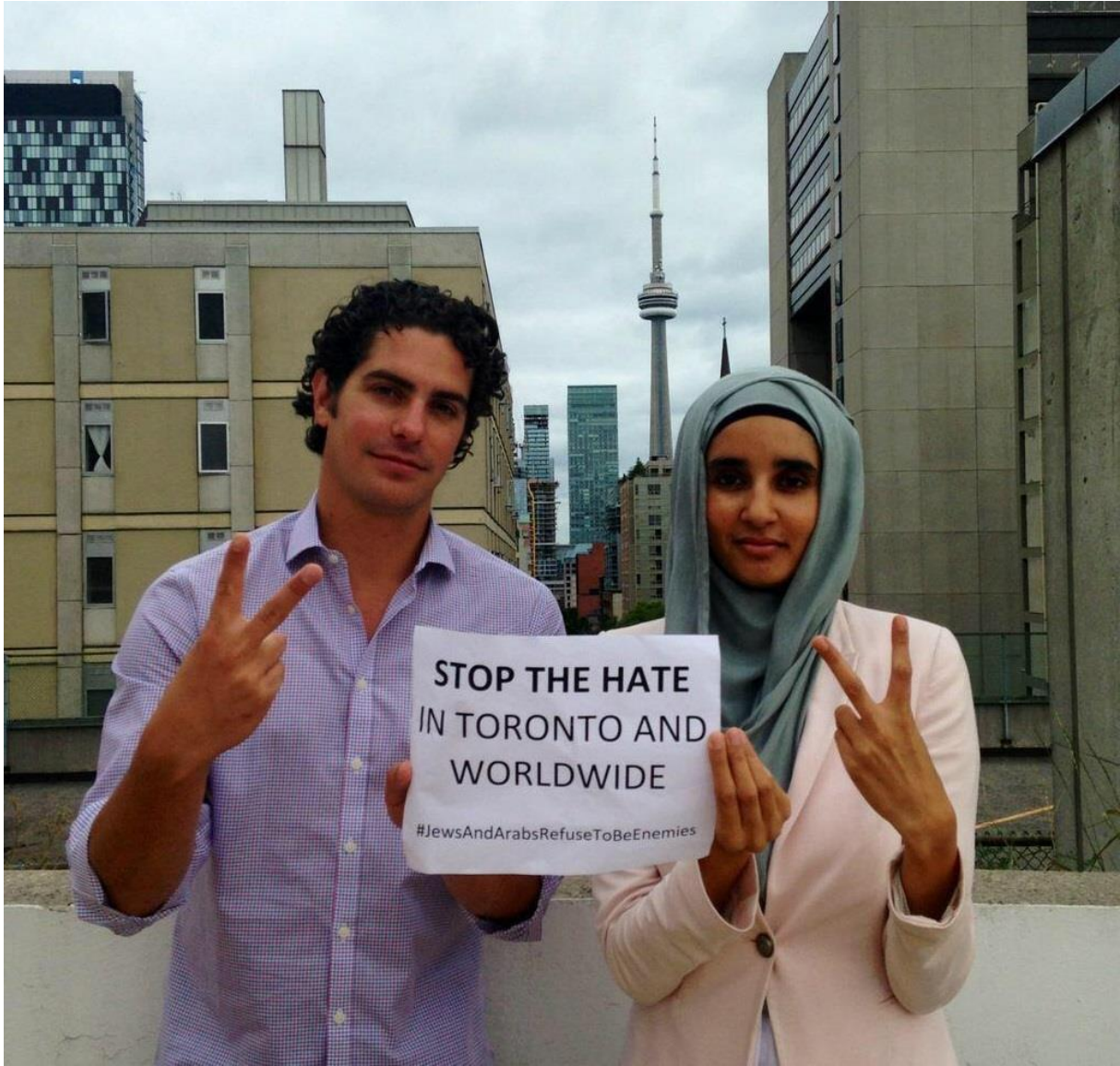
Figure 14 #JewsAndArabs4