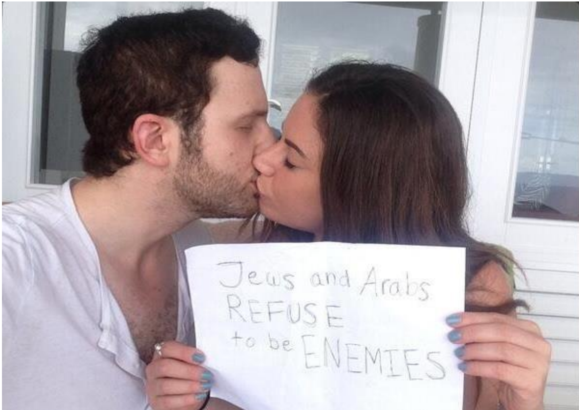
Figure 11 #JewsAndArabs1