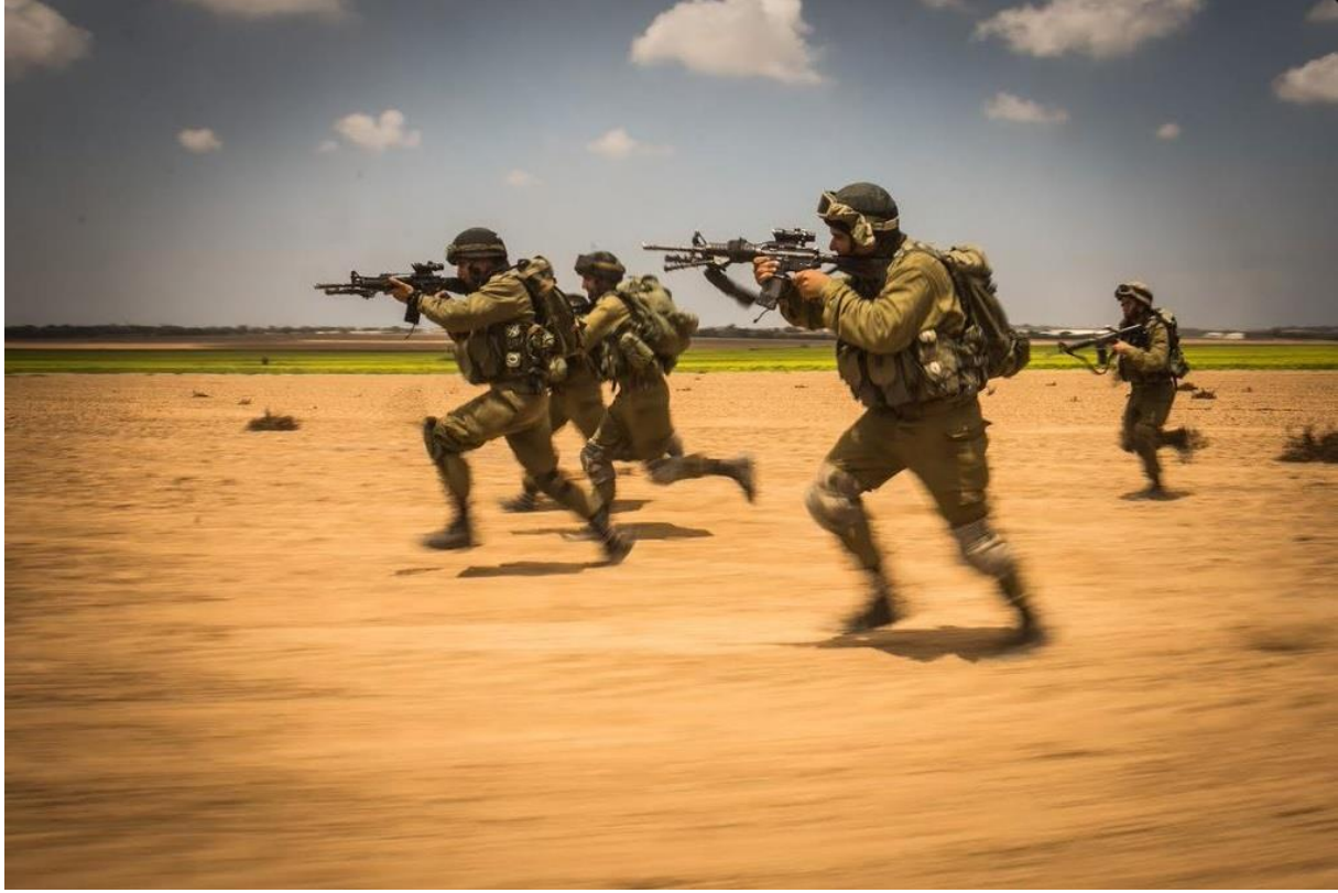
Figure 9 #IsraelUnderFire4