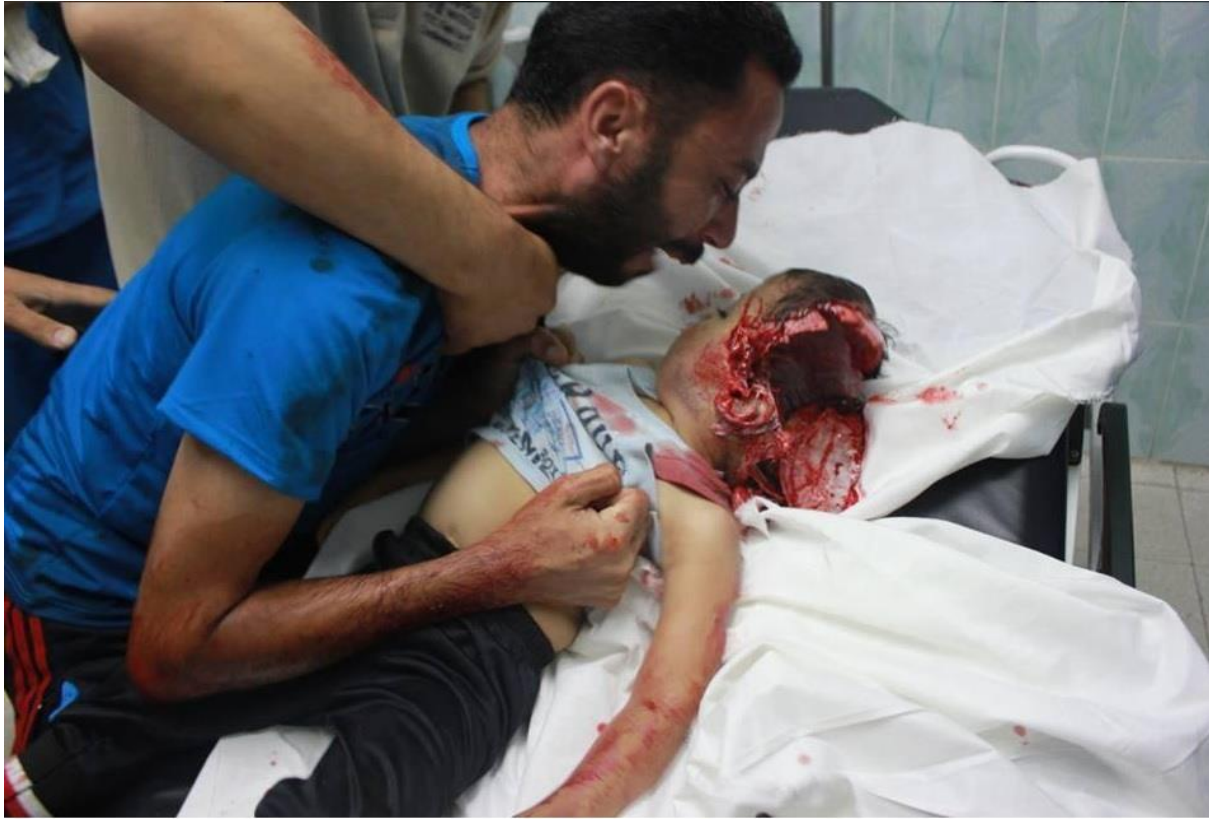
Figure 2 #GazaUnderAttack2