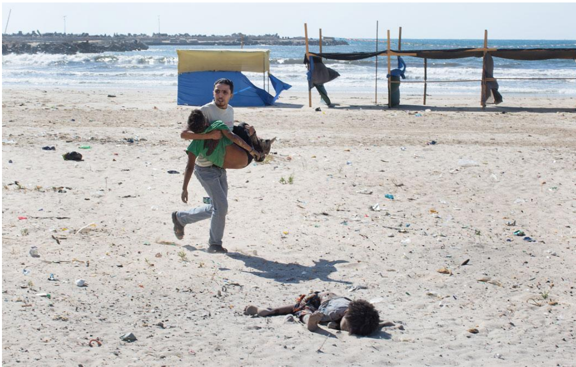
Figure 5 #GazaUnderAttack5