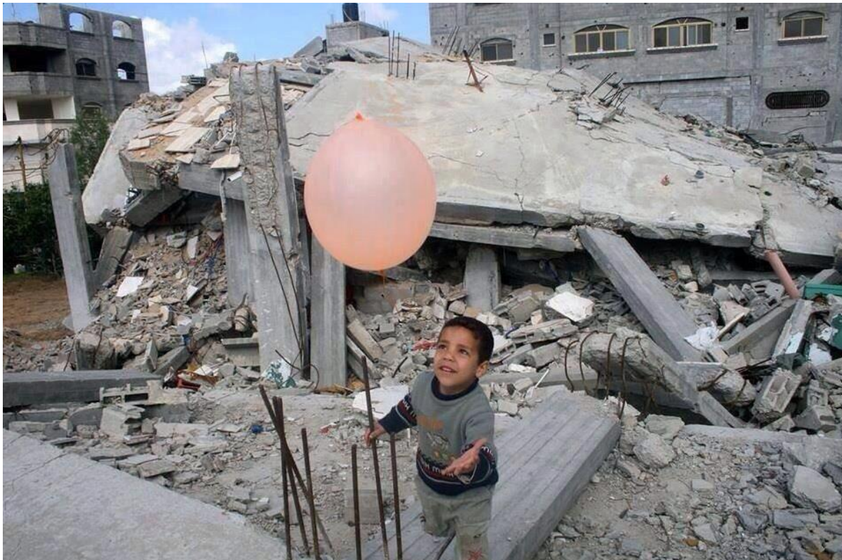
Figure 1 #GazaUnderAttack1