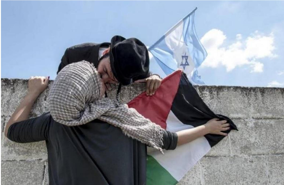
Figure 15 #JewsAndArabs5

Perhaps the most viral group of photographs, the humanitarian visual content mainly posted by users and heavily retweeted (and featured on multiple websites) call for the end of hostilities and peaceful co-existing. All images compose of both Jewish and Arab protagonists, unlike the first two groups which portrayed exclusively one side. On one hand, people wrote messages of peace and photographed themselves or had their photographs taken. On other instances, photographs were artistically constructed, like the photograph #JewsAndArabs5 of a couple overcoming the wall. The last one, along with the two boys on a pro-Palestinian rally call heavily on social conventions of clothing, symbolism of flags, walls, group distinction. Human beings recognize photographic convention on a subconscious level (Lister and Wells, 2001: 75-77). All the subjects of the photographs are seen coming together, in close and intimate physical contact. Photographs #JewsAndArabs 1 and 5 have a young couple, a man and a woman kissing. While it cannot be interpreted what is their ethnicity by observing their clothing or skin tone, it is obvious on the first photograph that the subjects are Jewish and Arab by the written message they hold. The other photograph does not have a verbal anchor. Instead, it relies on clothing conventions (the woman wearing a scarf over her head, the man seen with the lock of hair typical